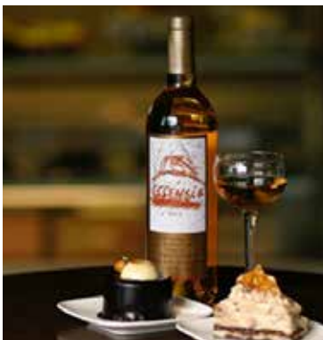
Chart new territory with your taste buds with these award-winning wines from sweet wine specialist Quady:

2012 Essensia – "Absolutely delicious. An addictive dessert wine. Drink it with cheesecake and go to heaven." – Wine Enthusiast Magazine , 2012